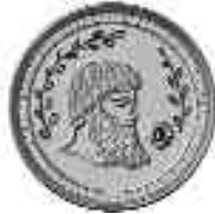
Mentoring Lion Lapel Pin

Successful Mentoring Lions and Protege Lions are awarded the handsome lapel pins you see here, accompanied by certificates of achievement. Together, they bestow deserved recognition upon truly unique Lions.