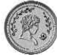
Protege Lion Lapel Pin

When your club Secretary receives the completed Achievement Form, he or she should notify the appropriate parties to arrange for club recognition and a celebration of your continued success. Take this opportunity to share your experiences with the Lions Mentoring Program and to acknowledge your continued growth as a Lion. In addition to celebrating your accomplishment with your club, your outstanding achievement will be honored at the district level.